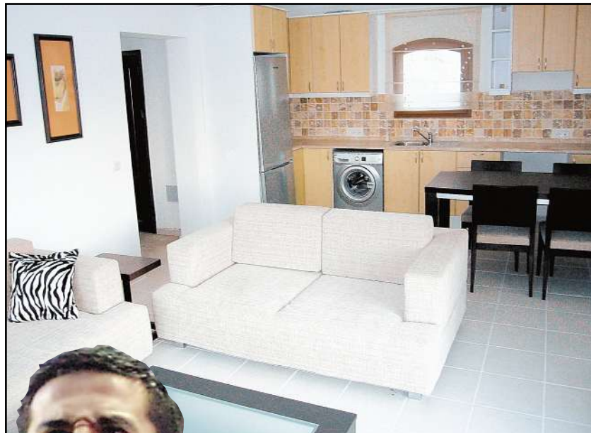
OPEN PLAN: The lounge and kitchen area