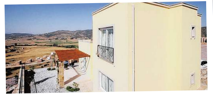
SPORTSMAN'S PARADISE: The villa has fabulous views of the nearby golf course, says Tim