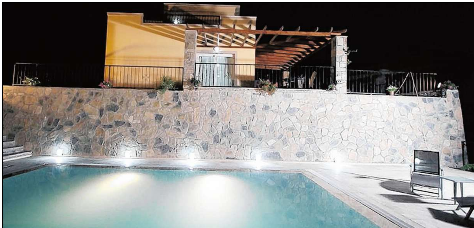
WATER VILLA: The private swimming pool at Tim Cahill's Turkish golf villa, near Bodrum

"But it's not just about money. It's a beautiful estate, with great villas, and a great place to be. I know I'm getting my money's worth and I hope to keep this villa for a very long time."